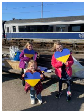
The girls showing love and support to refugees passing through Brasov.

Thank you all for your prayers and support! God bless you all!