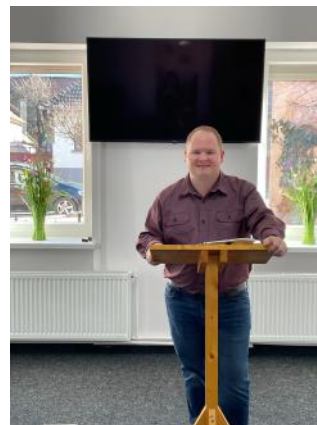
So thankful to be back at Faith Baptist Church in Zărnești and continuing the work.