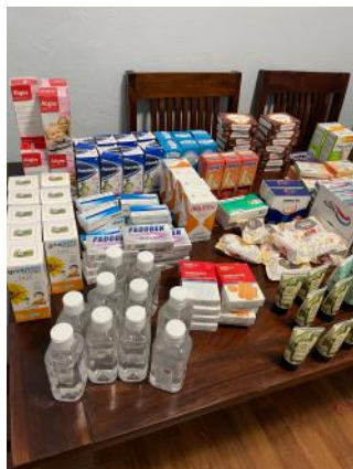
Just some of the medicinal items you all have helped supply to refugees.