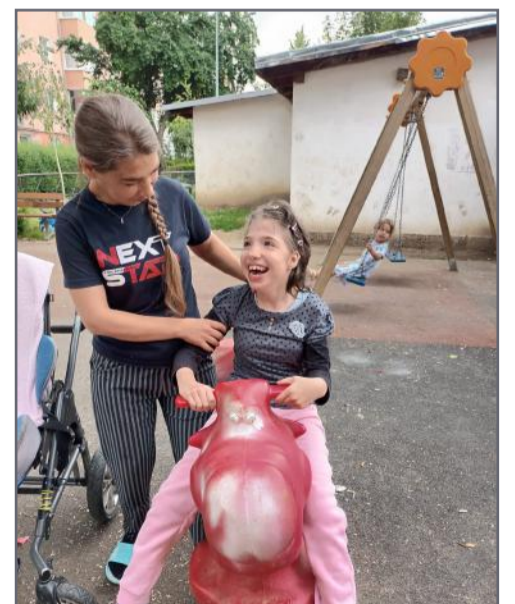
Mother and daughter from Cristian, Brasov, Romania. So grateful for the monthly help they receive.