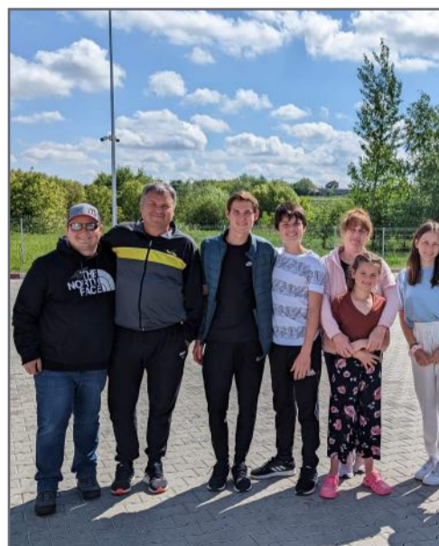
Helping to repatriate this Ukrainian family.